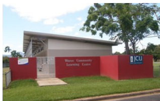
Community Learning Centre