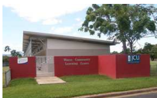
Community Learning Centre