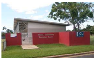
Community Learning Centre