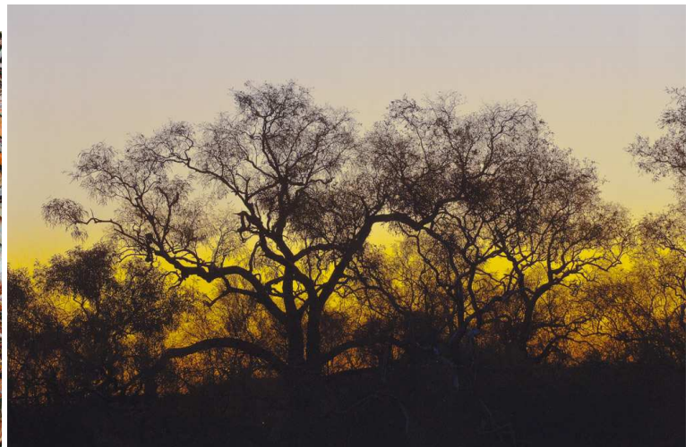
Honours: Darren Watt