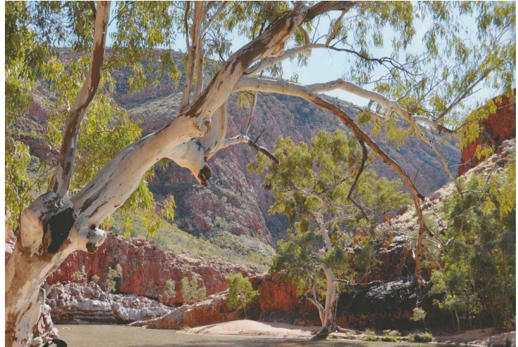
“River Gum” Honours: Yvonne Rein