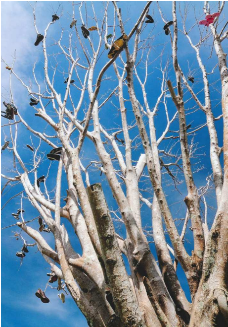
“The Shoe Tree” Honours: Vonnie Courtenay