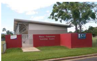
Community Learning Centre