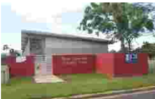
Community Learning Centre