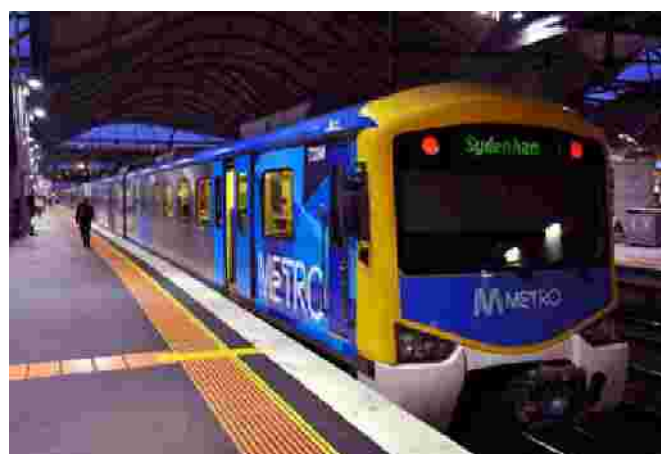
Division Two Honours "Southern Cross" Tim Warnock

WHERE ARE THE TITLES FOR YOUR PHOTOS????