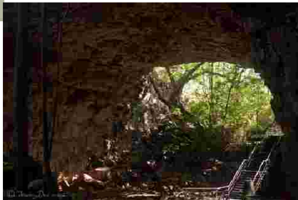
Lave Tube Mouth